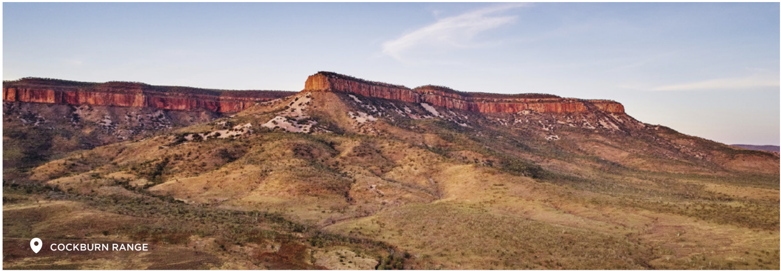
📍 COCKBURN RANGE