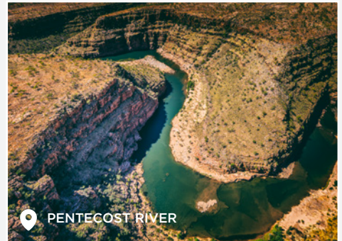
📍 PENTECOST RIVER

Take in the full scale of the East Kimberley. Fly beyond El Questro over the Cockburn Range, 'The Maze,' and Cambridge Gulf, with sweeping views of Emma Gorge and distant rivers.