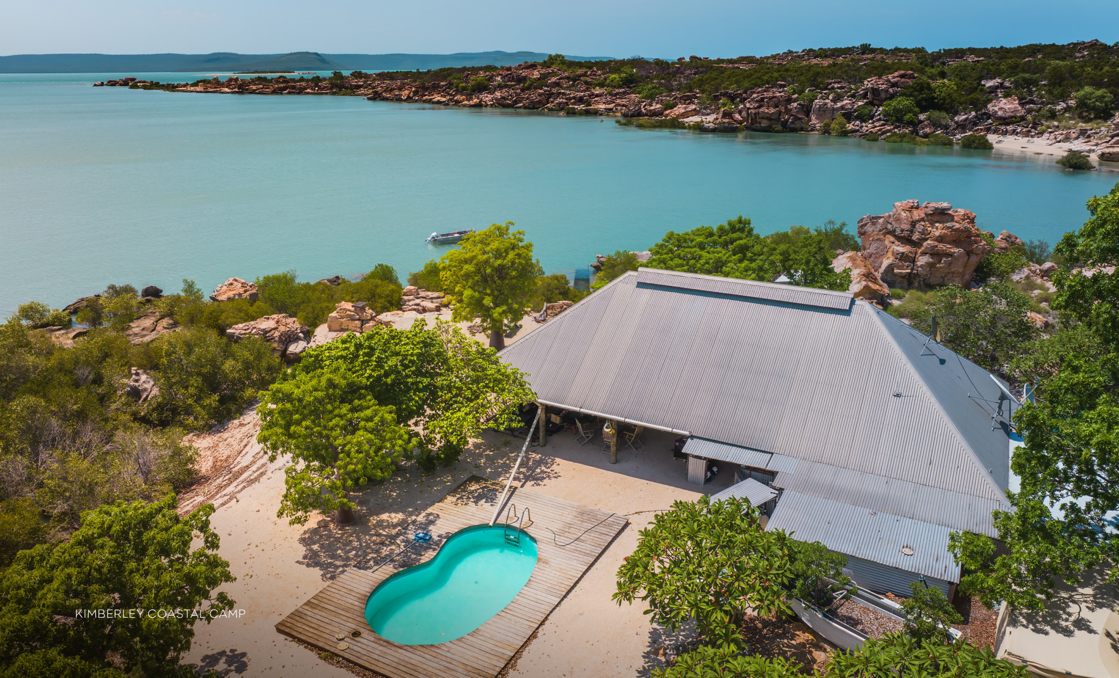
KIMBERLEY COASTAL CAMP