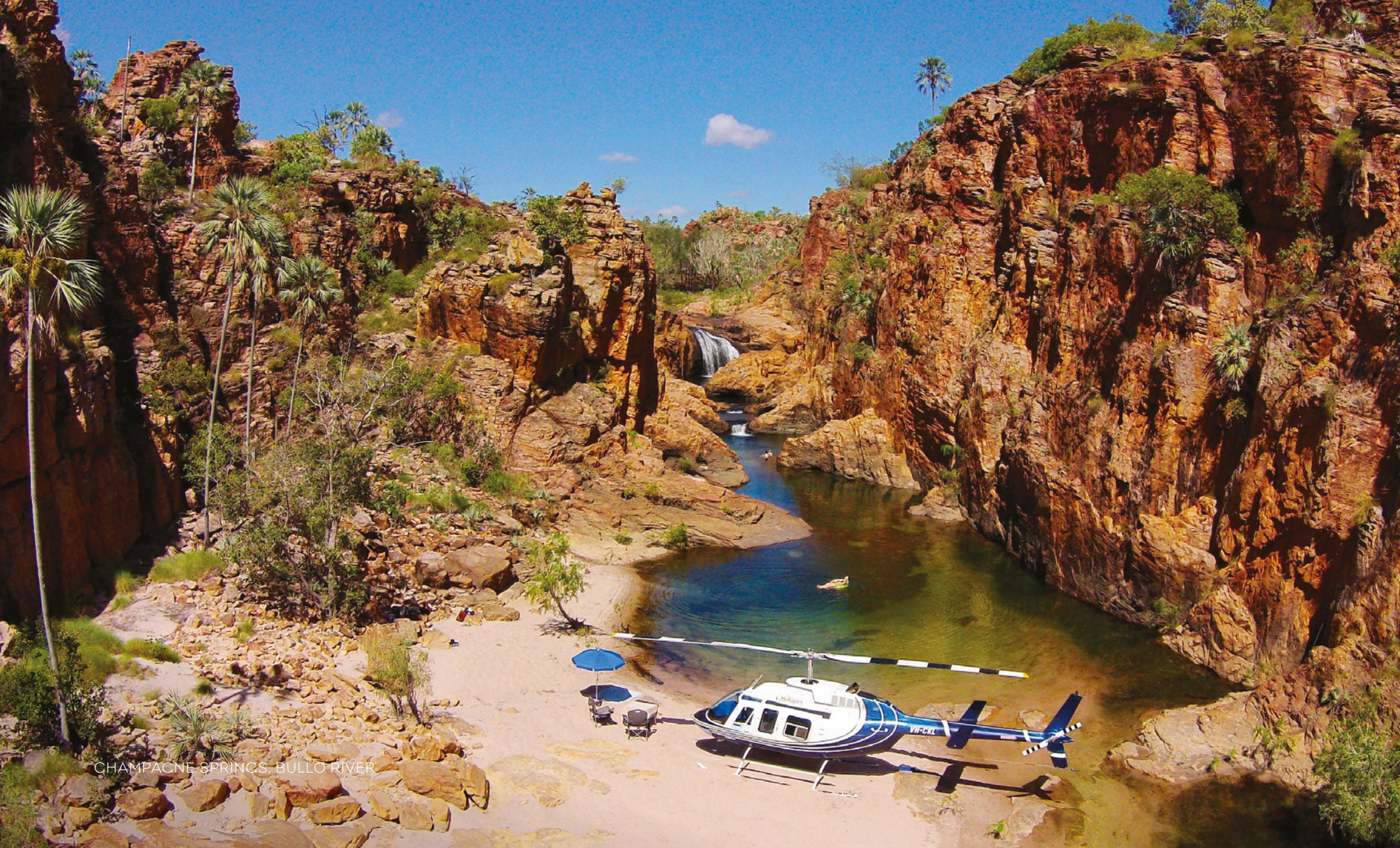
CHAMPAGNE SPRINGS, BULLO RIVER