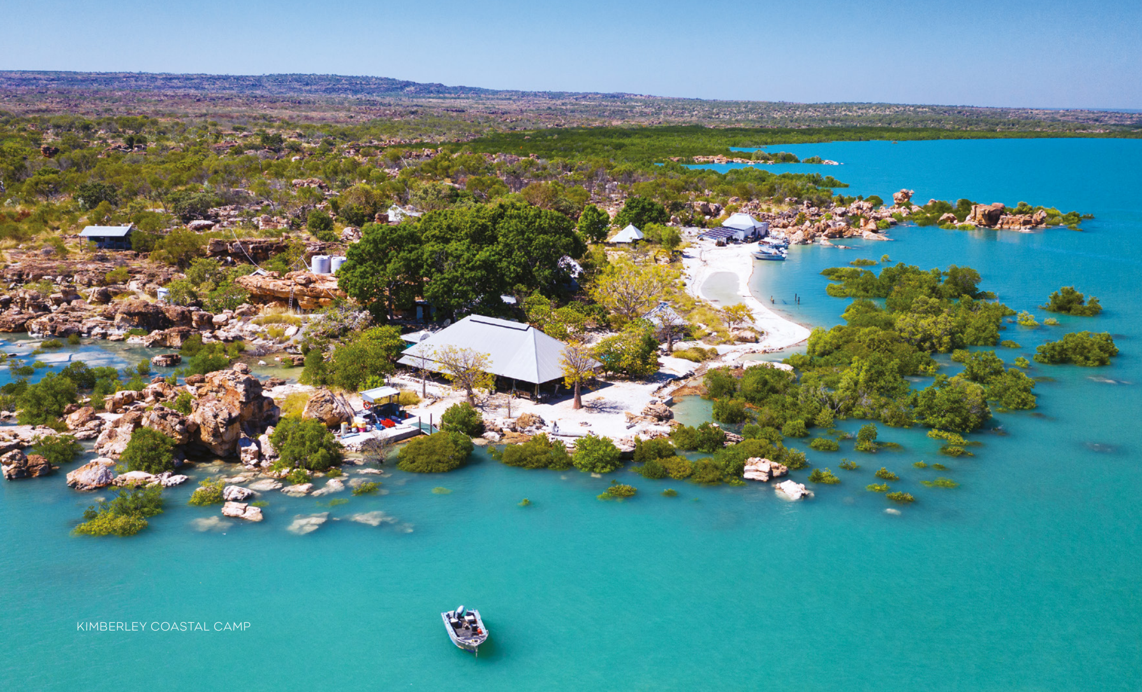
KIMBERLEY COASTAL CAMP